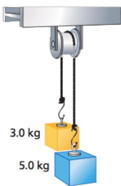
■ Figure 4-24